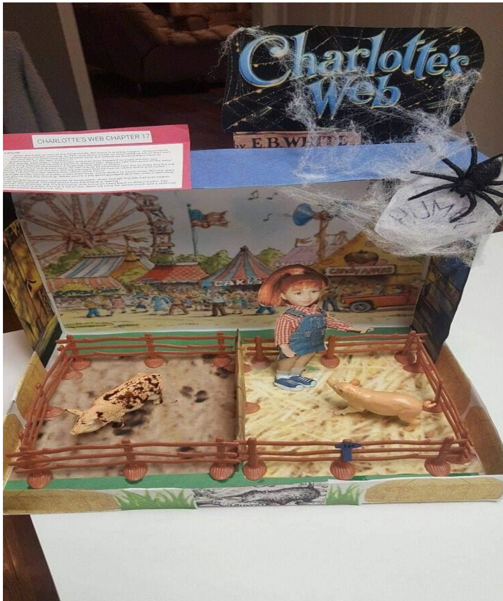
Book in box activity