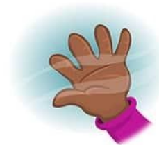
A Breeze On Your Hands