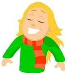
Sunshine On Your Face