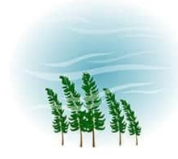
Wind In The Trees